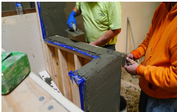
Certified Tile Installers know how to execute a vision.